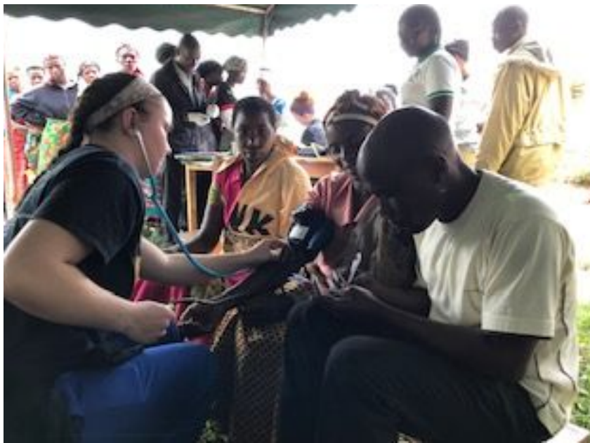
Medical Outreach at Joy Center